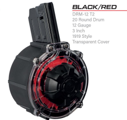
BLACK/RED DRM-12 T2 20 Round Drum 12 Gauge 3 Inch 1919 Style Transparent Cover