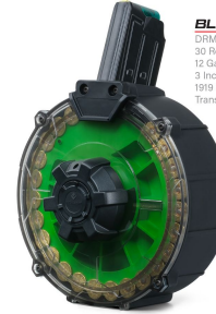
BLACK/GREEN DRM-12 30 Round Drum 12 Gauge 3 Inch 1919 Style Transparent Cover