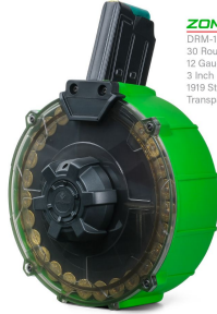
ZOMBIE GREEN DRM-12 30 Round Drum 12 Gauge 3 Inch 1919 Style Transparent Cover