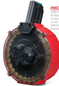
RED DRM-12 30 Round Drum 12 Gauge 3 Inch 1919 Style Transparent Cover