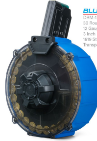
BLUE DRM-12 30 Round Drum 12 Gauge 3 Inch 1919 Style Transparent Cover