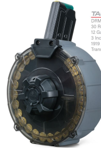
TACTICAL GRAY DRM-12 30 Round Drum 12 Gauge 3 Inch 1919 Style Transparent Cover