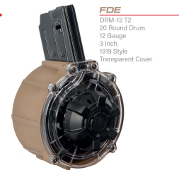
FDE DRM-12 T2 20 Round Drum 12 Gauge 3 Inch 1919 Style Transparent Cover