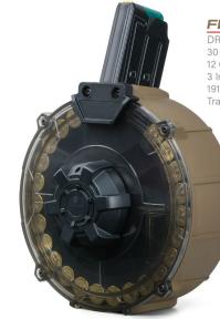
FDE DRM-12 30 Round Drum 12 Gauge 3 Inch 1919 Style Transparent Cover