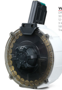
WHITE DRM-12 30 Round Drum 12 Gauge 3 Inch 1919 Style Transparent Cover