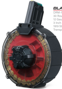
BLACK/RED DRM-12 30 Round Drum 12 Gauge 3 Inch 1919 Style Transparent Cover