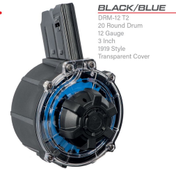
BLACK/BLUE DRM-12 T2 20 Round Drum 12 Gauge 3 Inch 1919 Style Transparent Cover