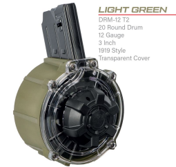
LIGHT GREEN DRM-12 T2 20 Round Drum 12 Gauge 3 Inch 1919 Style Transparent Cover