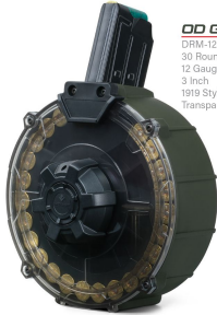
OD GREEN DRM-12 30 Round Drum 12 Gauge 3 Inch 1919 Style Transparent Cover