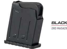
BLACK 2RD MAGAZINE