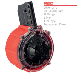
RED DRM-12 T2 20 Round Drum 12 Gauge 3 Inch 1919 Style Transparent Cover