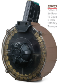
BRONZE DRM-12 30 Round Drum 12 Gauge 3 Inch 1919 Style Transparent Cover