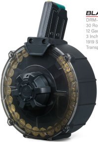
BLACK DRM-12 30 Round Drum 12 Gauge 3 Inch 1919 Style Transparent Cover