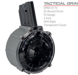
TACTICAL GRAY DRM-12 T2 20 Round Drum 12 Gauge 3 Inch 1919 Style Transparent Cover

All parts are changeable and optimal for service considering spare parts, even the metal magazine part. We can put 2+1, 5+1, 10+1 limiters according to importation laws of the target country. Designs and some working parts are patented.