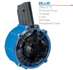
BLUE DRM-12 T2 20 Round Drum 12 Gauge 3 Inch 1919 Style Transparent Cover