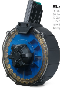
BLACK/BLUE DRM-12 30 Round Drum 12 Gauge 3 Inch 1919 Style Transparent Cover