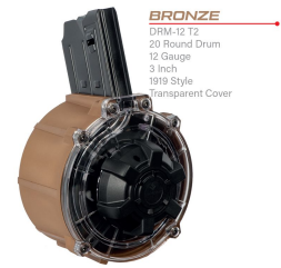
BRONZE DRM-12 T2 20 Round Drum 12 Gauge 3 Inch 1919 Style Transparent Cover